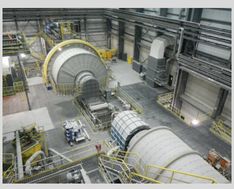
The grinding circuit mills break solid material into smaller pieces.