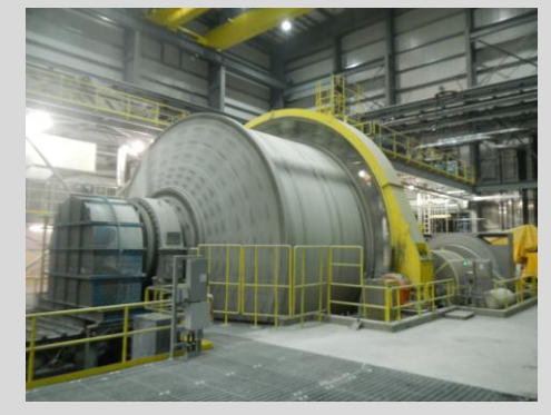
The 7,500-HP SAG mill operates in the grinding circuit.